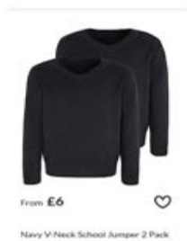
George at Asda

Please see below some examples of high street options for V neck jumpers for your reference: