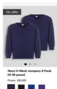
Tu at Sainsbury's