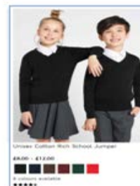
Marks & Spencer

If there are any queries or concerns regarding this temporary change please do not hesitate to contact myself or your child's Head or Deputy Head of House.