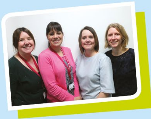
Young carer advisers at a local university

Caring is part of everyday life and it can be really rewarding. You may find you cope really well most of the time, but sometimes it's good to know where to get help if you need it. For example, if the person you care for urgently needs you while you are away from home. Wherever and whatever you study, there will be someone available to give you the time and space you need to talk things through.